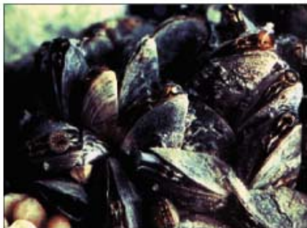
Zebra mussels often live together in high densities and attach themselves to rocks, pipes and other shells by adhesive byssal threads. The mussels are open most of the day, siphoning water through the large (incurrent siphon) opening, and passing it out the excurrent siphon.

Environmental effects from the spread of zebra mussels are alarming. For instance, the mussels are extremely efficient filter-feeders, consuming large portions of microscopic plants (phytoplankton) and