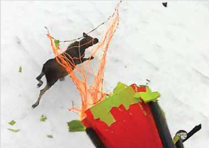
Perched inside the pursuing helicopter, one of the wildlife capture crew members locates a moose for collaring and launches a net.