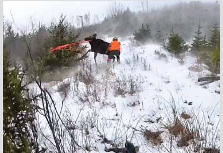
When the moose is caught in the net, one of the "muggers" jumps into action, undertaking the dangerous job of restraining the animal.

The cold was a problem. A big problem. After months of careful planning and preparation, weather was the one thing we couldn't control, and it was threatening to unravel all of our hard work.