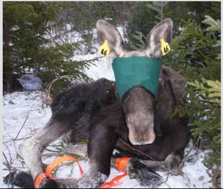
Before being released, each moose is fitted with a tracking collar and ear tags for monitoring and identification.

they die.) This weather happens from time to time in much of North America, causing occasional winter tick-caused mortality events. What we found in the 2001–2005 period was that this weather pattern is becoming the norm in New Hampshire. As a result, our moose are carrying heavy tick loads almost every year, resulting in increased mortality and lower body weights, with an associated drop in birth rates.