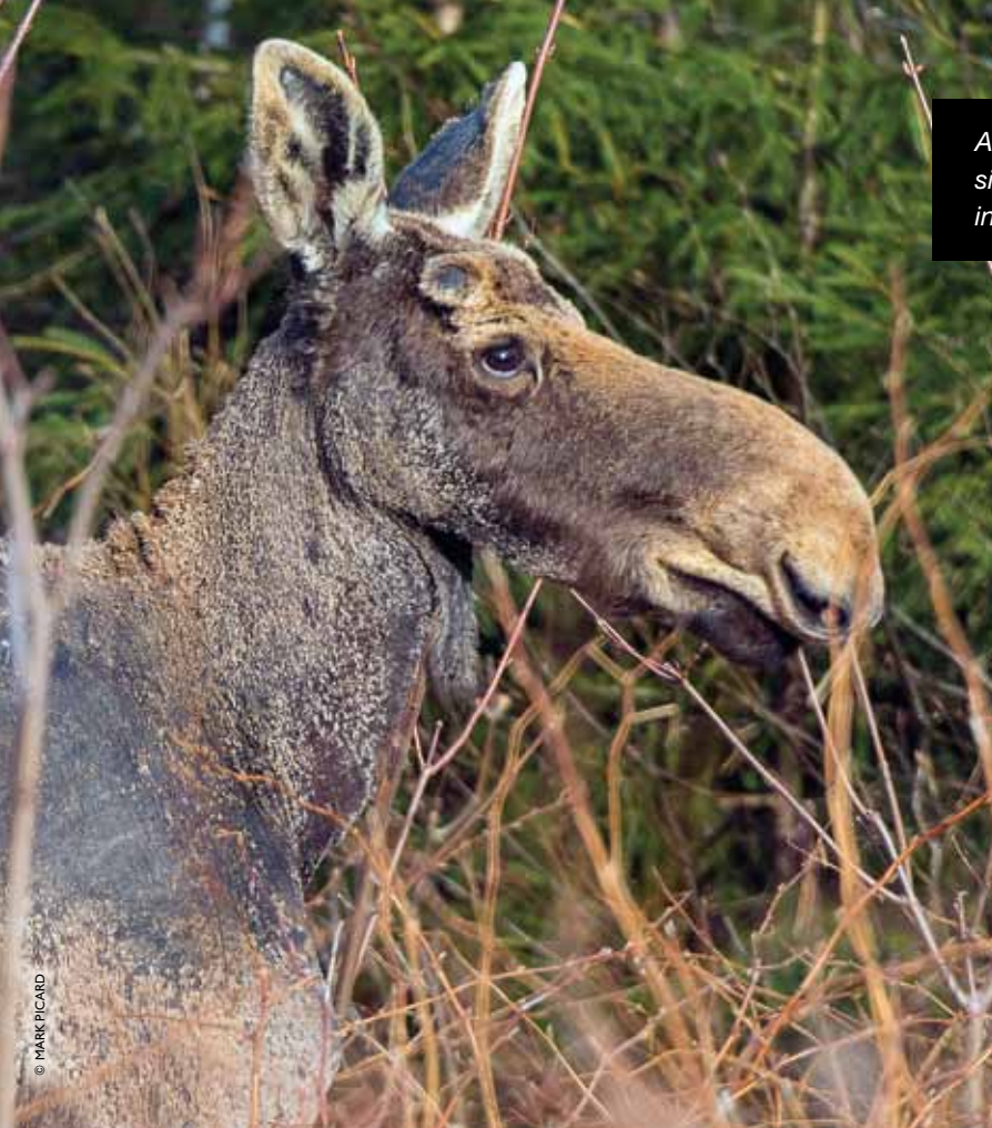
A young bull moose displays the tell-tale signs of being afflicted with a winter tick infestation, having lost almost half its coat.

Maine is currently conducting a similar study with GPS-collared moose, to assess the impact of winter tick on its 70,000-animal moose herd. We will be sharing and comparing information as these studies continue.