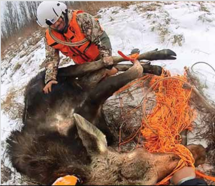
The moose is then subdued with straps and sedated, so that biological data can be collected.