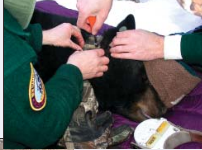
Biologists keep a baby bear warm while its mother's telemetry collar is replaced; afterwards the cub is snuggled back into the den. The work is part of a 3-year tracking study that helped quantify bear use of human environments.

lected using a hair-removal trap. Analysis of a black bear's DNA (which, like human DNA, is unique to an individual) provides a genetic profile; in the study, we use this genetic profile to “mark” individual bears. Hair samples acquired during subsequent capture sessions are compared to the original samples to determine how many of the bears are “repeats.” These recapture rates are used in conjunction with established scientific models to develop a population estimate.