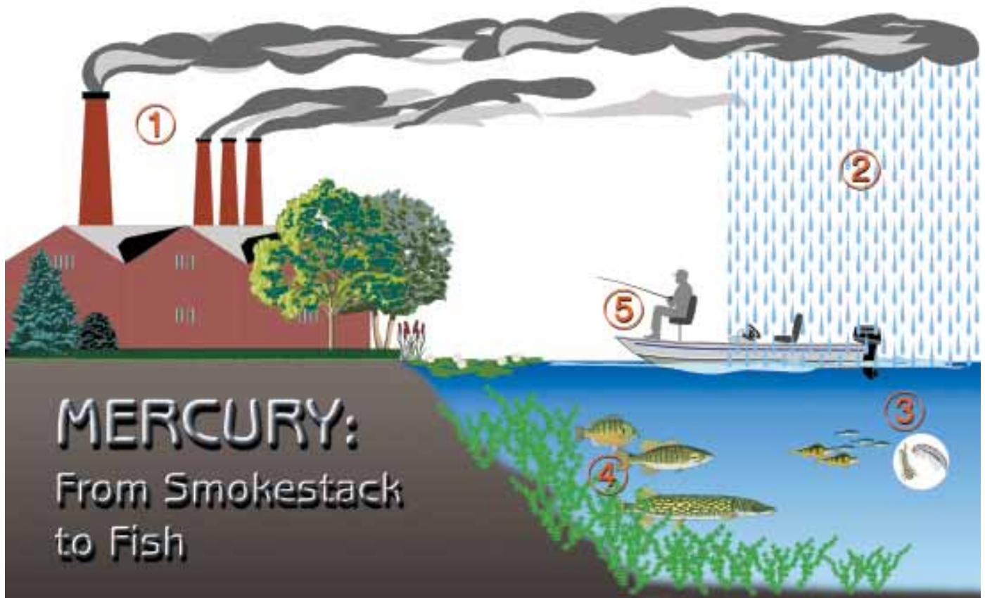
Mercury gets into the atmosphere from coal-fired power plants and incinerators that burn household and industrial wastes (1). It's carried long distances in the atmosphere, and deposited to land and water by rain or snow (2). In water, elemental mercury is converted into more toxic methyl mercury by bacteria (3) and is absorbed by small aquatic life and through the gills of fish. Mercury accumulates over time in fish tissue (4), particularly in older and larger fish. Mercury can also accumulate in human tissue (5) and in high concentrations, can pose health risks.

Since methyl mercury is generally present at higher concentrations in older and larger fish, women of reproductive age and young children may consider eating only smaller fish.