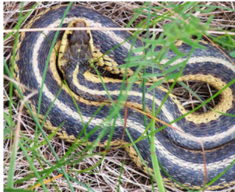
Garter snake – common statewide