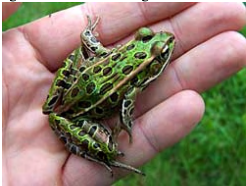
Northern Leopard Frog

We need verified reports of Leopard frogs ; photos are crucial!! Most reports of Leopard frogs turn out to be Pickerel and green frogs. Focus searches during late summer in floodplains, fields, and agricultural areas along rivers. See the NHFG website for description of species.