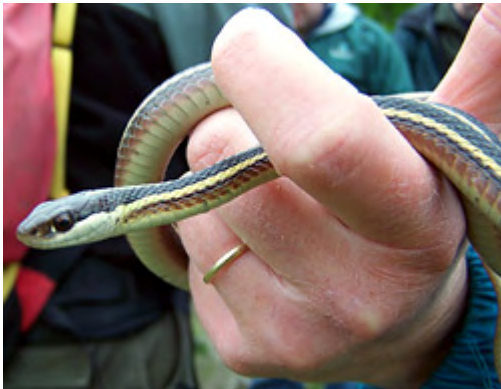
Ribbon snake - not common

Ribbon snakes and smooth green snake were listed in the NH Wildlife Action Plan as Species of Greatest Conservation Need. Photographs are critical for Ribbon snakes. Check out the NHFG website to help with identification.